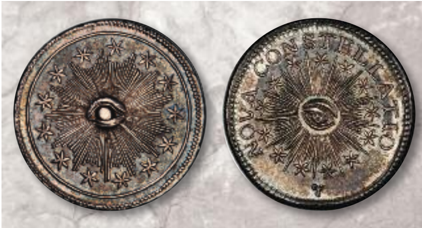
▲ THE EYE AND RAYS on the “Plain Obverse” design (left) are more elegant and exact than those found on the “With Legend” type, which also lacks paired rays.