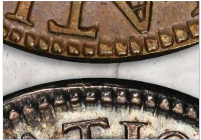
▲ THE BEADED BORDER on the 5-unit “With Legend” piece (top) is similar to that on the “With Legend” quint (bottom), suggesting that these dies were sunk at around the same time with the same punches.

The stylistic differences between the two design types, border variations and observations about die state are particularly revealing in light of the schedule of payments made by the government to the two Philadelphia engravers