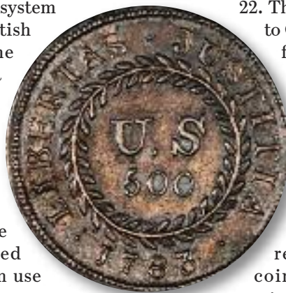
◀ THE 1783 Nova Constellatio silver 500-unit quint with a plain obverse is unique.