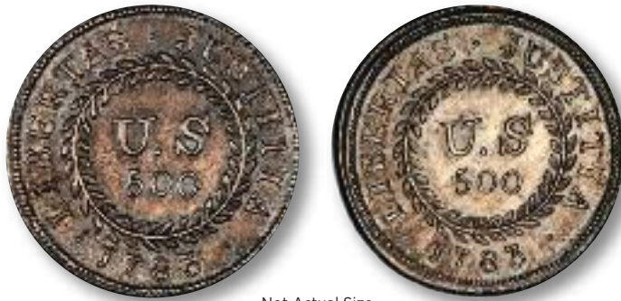
Not Actual Size