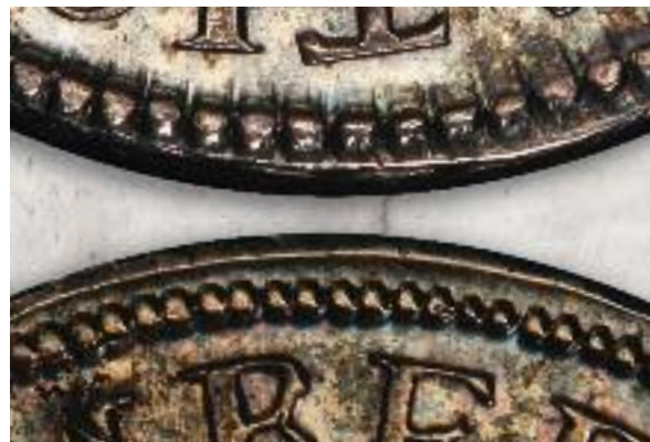
▲ THE BEADED BORDER on the obverse (left, top) of the “Plain Obverse” Nova Constellatio quint is similar to the beads on its reverse (left, bottom). The “With Legend” quint’s beaded border (right, top) has larger beads than those found on the “Plain Obverse” quint (right, bottom), suggesting it was created at a later date.