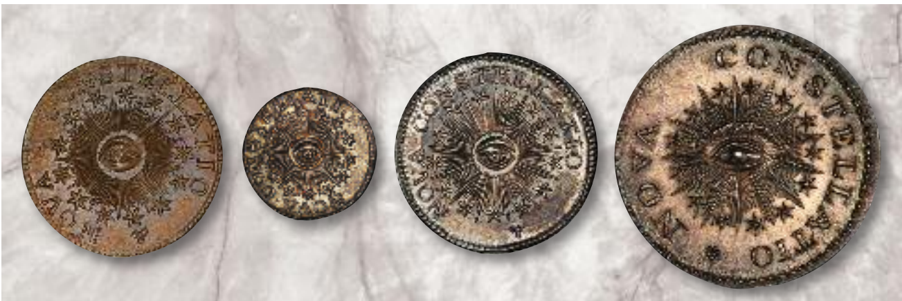
▲ FOUR OF THE coins included in the set delivered to Congress were (from left) the Nova Constellatio 5-unit copper, a 100-unit bit, a 500-unit quint and a 1,000-unit mark. (Morris' initial plan also called for an 8-unit copper.)

While Morris' records do not indicate the composition of the set, his monetary plan called for the following denominations: a silver 1,000-unit mark, a silver 500-unit quint, a silver 100-unit bit, an 8-unit copper and a 5-unit copper. The set remained with Congress until 1784. In March of that year, the