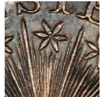
▲ CLOSE-UP VIEWS of the rays found on the “Plain Obverse” type (top left) compared with those engraved on the “With Legend” coins reveal the precision with which the former is engraved compared to its cruder counterparts.